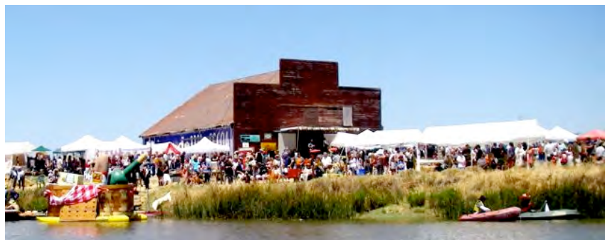
The “Rivertown Revival” brought 4,800 people to the River Heritage Center

We deeply appreciate the people, organizations, and businesses that have helped to make the past year’s achievements possible. It is through the help of our many supporters, volunteers and community partners that we have been able to accomplish these successes. Thank you all!